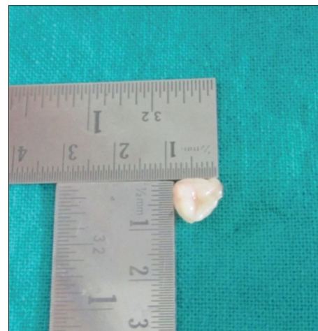
Figure 4: Gross specimen of excised tissue