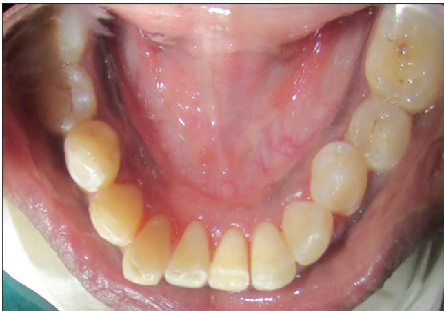
Figure 7: 6 months post-operative

differences are that the skin lesions have not been associated with oral lesions, and they do not show same frequency of occurrence and age distribution.