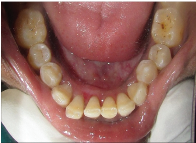
Figure 6: 1 week post-operative