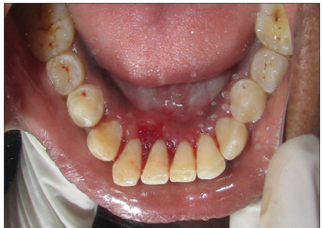
Figure 3: Immediate post-operative