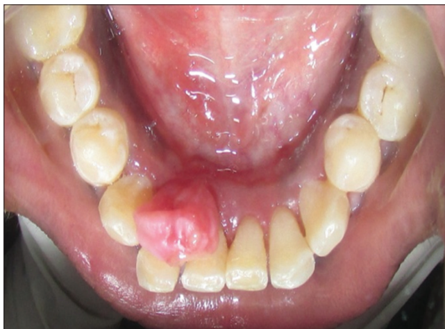
Figure 1: Pre-operative

Campos and Gomez [11] and Weathers and Campbell [12] suggested that the stellate and multinucleate cells of giant-cell fibroma have a fibroblast phenotype and are large atypical fibroblasts. A variety of cutaneous lesions such as the fibrous papule of the nose, ungual fibroma, acral fibrokeratoma, and acral angiofibroma containing similar stellate mono- and multinuclear giant cells have been described in humans. The main similarity between this group of cutaneous lesions and the giant-cell fibroma is their histologic appearance. The